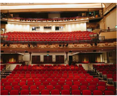
Theatre photos on this page are courtesy of the Academy Center of the Arts